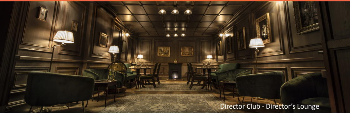
Director Club - Director's Lounge