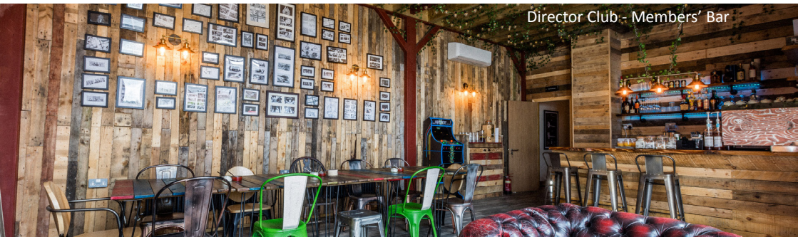
Director Club - Members' Bar

Available on their website - director-club.com